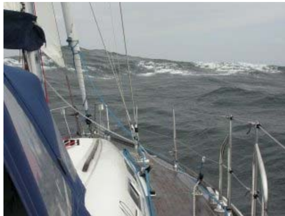
Heading into a 30' wave in heavy overcast conditions

snow on the hills of Nfld (during July). On July 16 th when they stopped in St. John's Nfld, they were approximately ½ way (by distance) to their final destination of Amsterdam. After a two day rest, they set out on the Atlantic crossing.